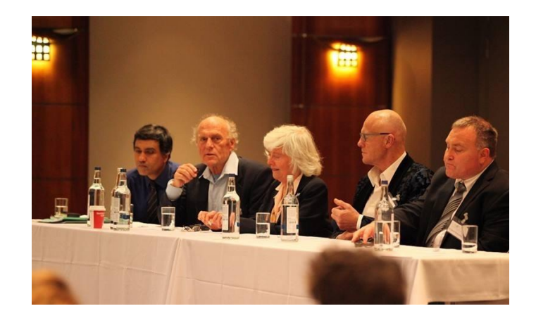
Speaker panel at LTV II

copy. We will put a notification on our home page as soon as it has been completed.